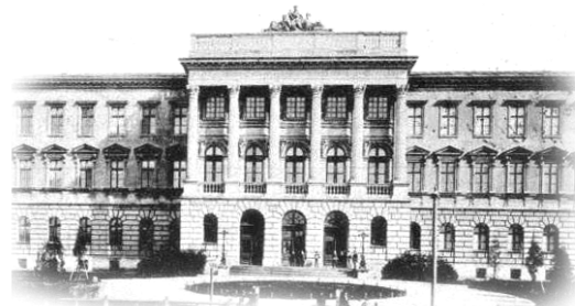
Lviv Polytechnic National University Main Building

Lviv Polytechnic National University Students' and PhD Students' Union and Self-government Young Scientists' Council